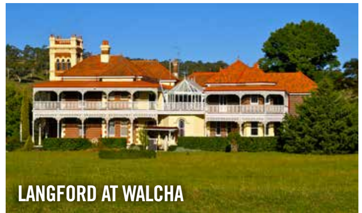
LANGFORD AT WALCHA