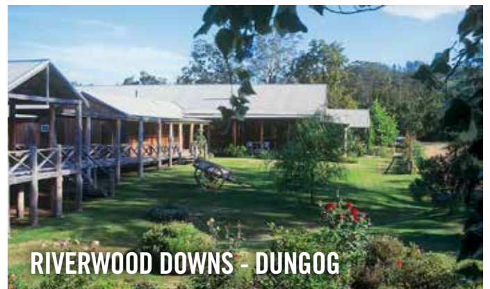
RIVERWOOD DOWNS - DUNGOG

The KTM logo, consisting of the letters "KTM" in a bold, italicized font, set against a black background.