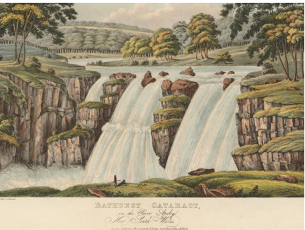
Above: Joseph Lycett – painted from a sketch by George Evans of 'Bathurst Cataract on the River Apsley, New South Wales'.